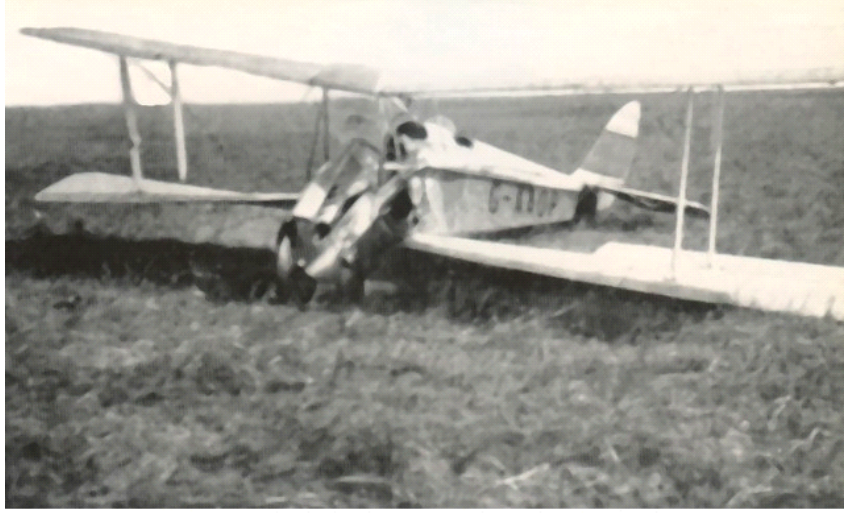
The G-AADP after crashlanding in Syria

The next day they started very early in order to make use of the cool morning air in crossing the mountains. The engine therefore served them well up to 2500 m and they reached the coastal plain at the neighbourhood of Adana, Turkey.