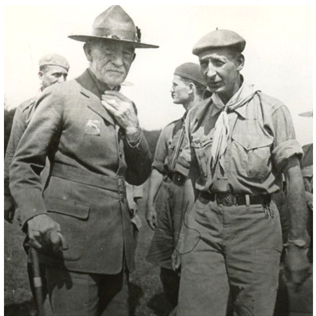
Baden-Powell and Almásy at the Jamboree Gödöllő, 1933

newly established Flying Boy Scouts in particular.