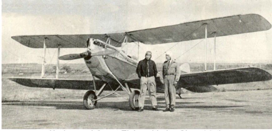
Almásy and Count Zichy with the Gipsy Moth

They were able to take off again the next day. Their flight plan called for a flight eastward over the very rugged Black Sea coast. After barely 30 minutes of flight, the engine oil pressure started to drop and they turned to fly back to Istanbul, where they landed